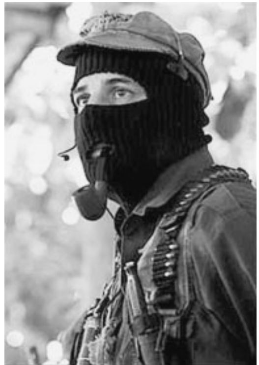
1. Subcommandante Marcos smoking his famous pipe in Mexico City, D.F., March 2001.