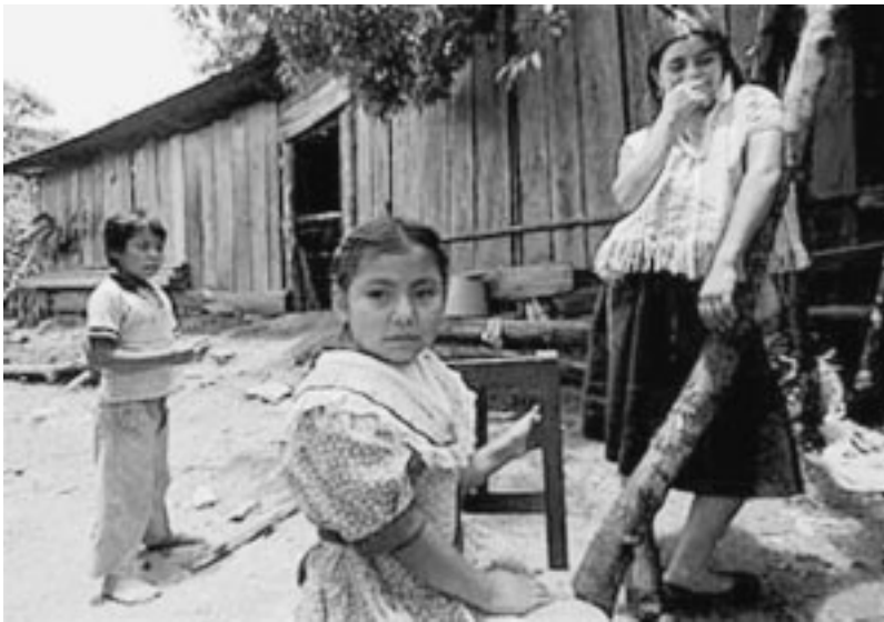
3. Three children playing in La Realidad, one of the Zapatista Autonomous Communities in Chiapas, Mexico, March 2001.